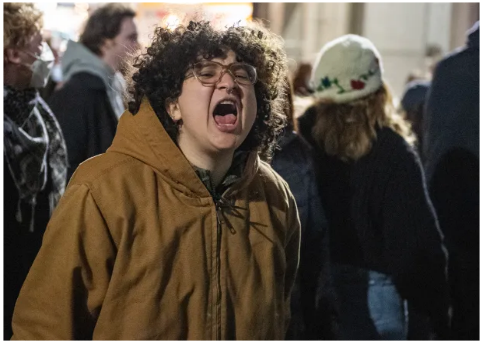
Pro-Palestinian supporters yell at police after the Emerson College Palestinian protest camp was cleared by police in Boston early Thursday.